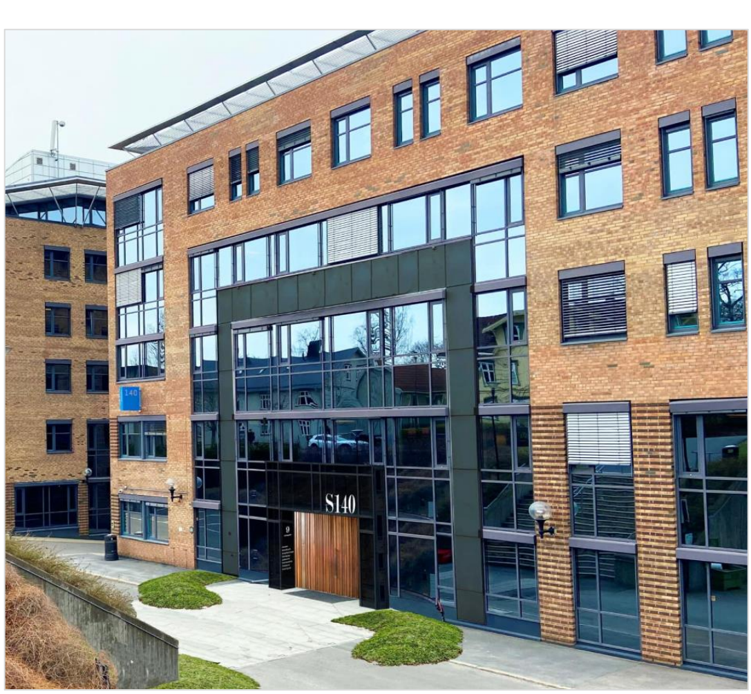
Sandakerveien 140, Nydalen - Oslo