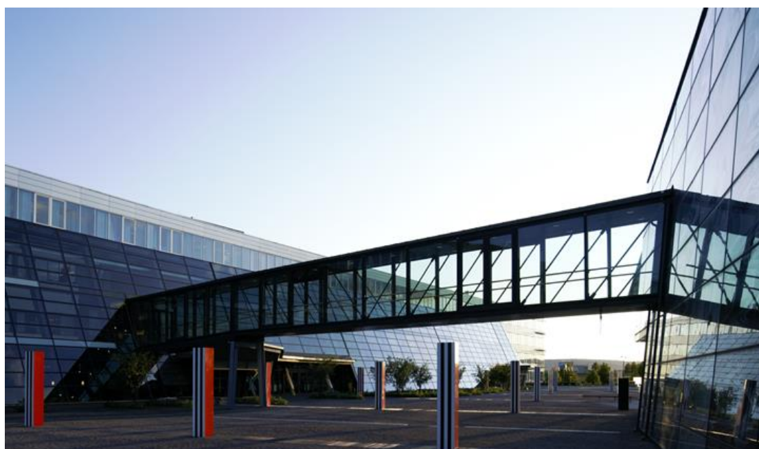
Snarøyveien 30, Fornebu