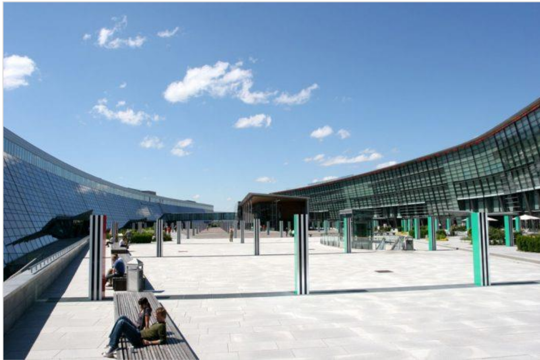
Snarøyveien 30, Fornebu