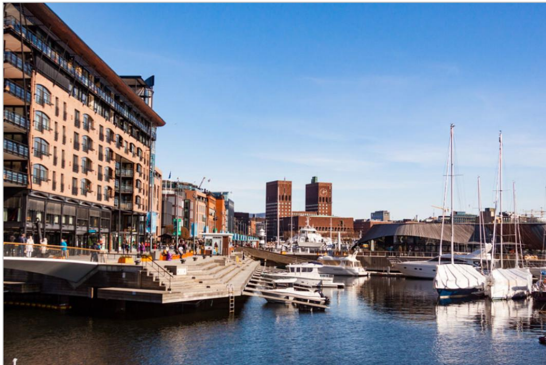
Aker Brygge, Oslo